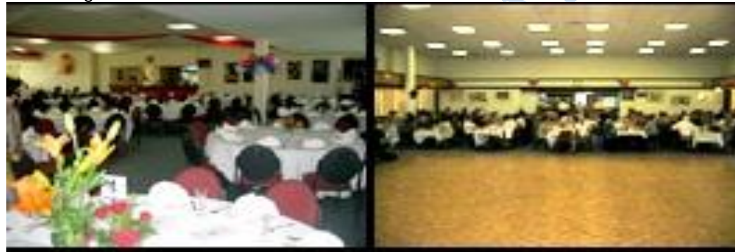
Macedonian Club of WA, New Home of INBA events in Western Australia.

Welcome to the first event at our new venue, the Macedonian Community of WA www.macedoniawa.com.au The venue has plenty of parking . A huge backstage area for competitors and is centrally located. It also features a fully licenced bar with food being available inside the venue.