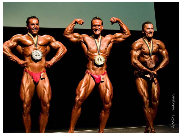
Class 3 Open Men