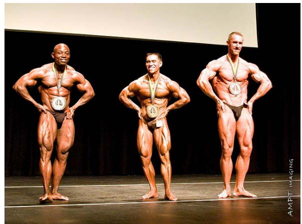
Men's Masters Division (40 - 49)