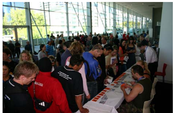
Registration the day prior

With over 200 competitors, registration for the show ran surprisingly smooth on Friday night, setting the pace for the actual event the following day.