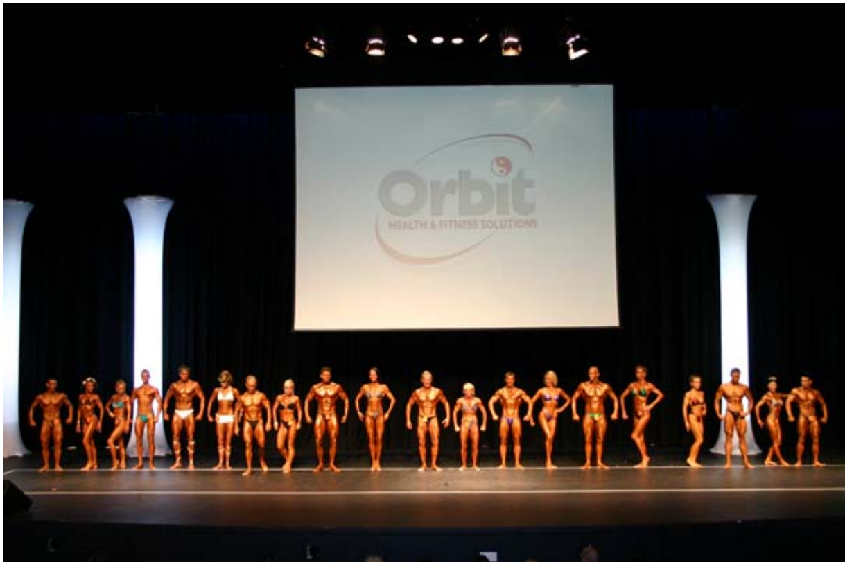
Mixed Pairs fill the Natural Olympia stage

The weekend of November 18, 2006 saw the Australian city of Perth, Western Australia buzzing with plenty of excitement. Above the city famous for its black swans, the "Formula One of the Sky", also known as the RED BULL AIR RACE, was preparing to wow spectators, with pilots practising their flips and turns for the Sunday race spectacular.